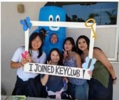
Key Club & Art Club