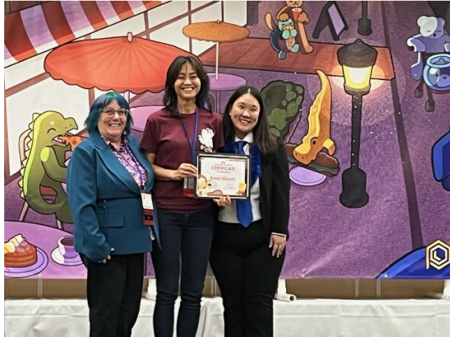
Turquois Div won the first Cheer