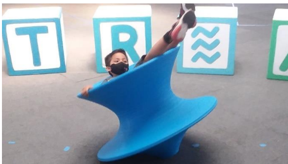
Kids take to it like "a duck take to water"