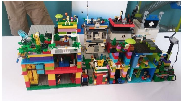
Just one of the great Lego displays