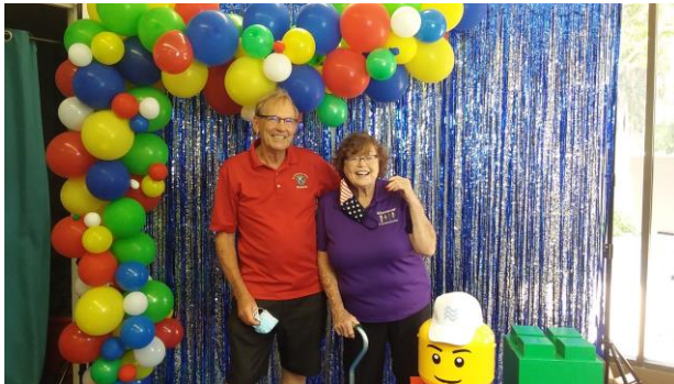
We only uncovered for the photo shoot